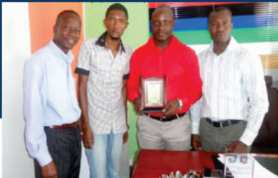
Chevron Safety Award Best Contractor & 10Million Man-hour Without lost time injury in EGTL Project

Biloritz is interested in the health and safety of its employee and of all the other personnel involved in its project activities, as well as the protection of the environment, shall be assured by an efficient and well documented system which is in line with ISO 14001 international regulations.