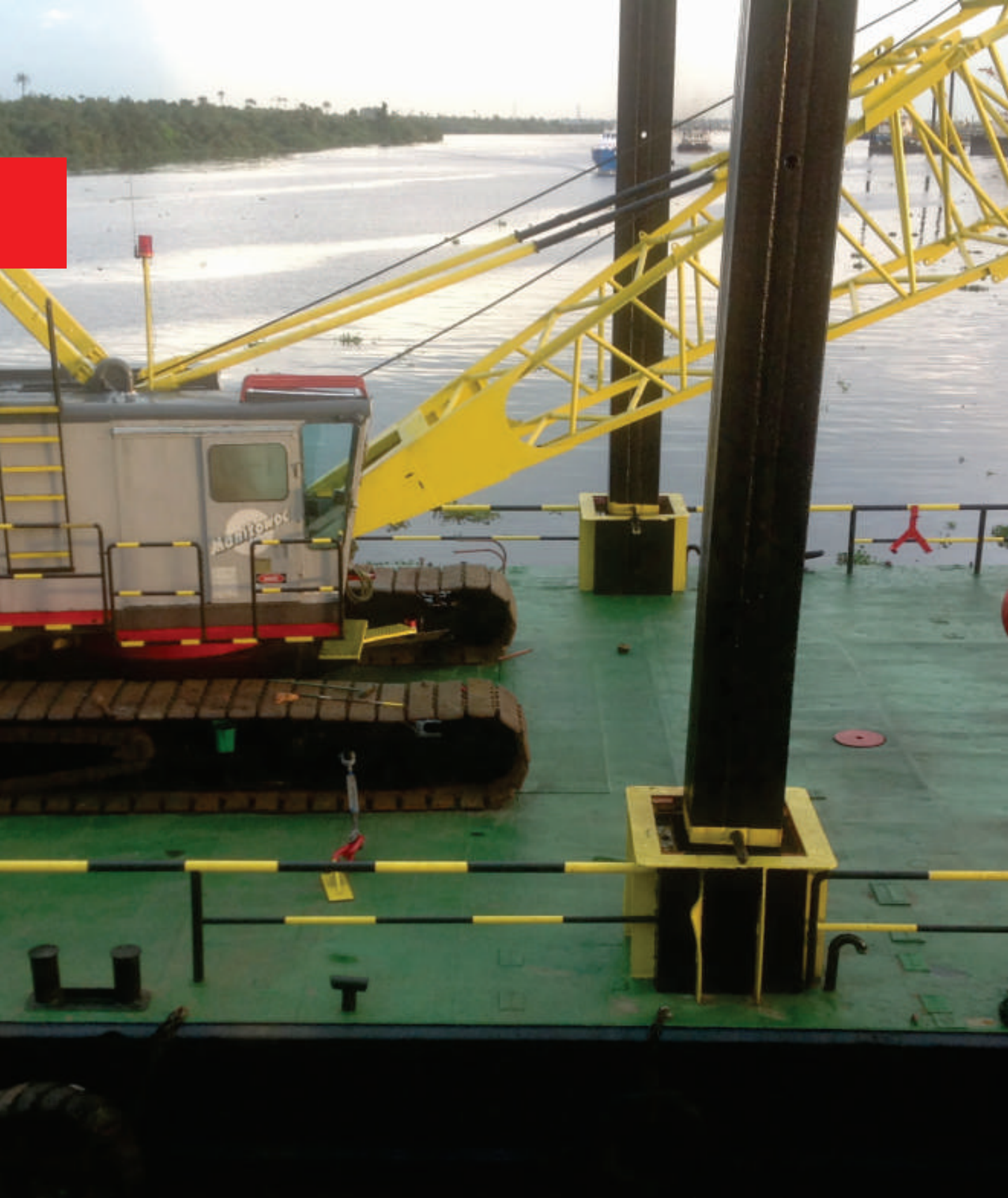
120 Ton lease crane to Natony-Shell