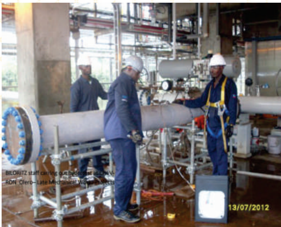
Biloritz staff Carrying out hydro test at Chevron Olero - Late Mechanical Works

BNL has adopted a quality system that is in line with ISO 9001 regulation