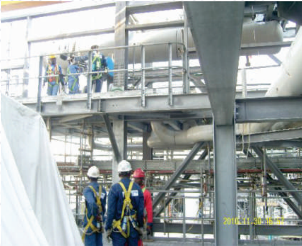
Piping Works At ECTL