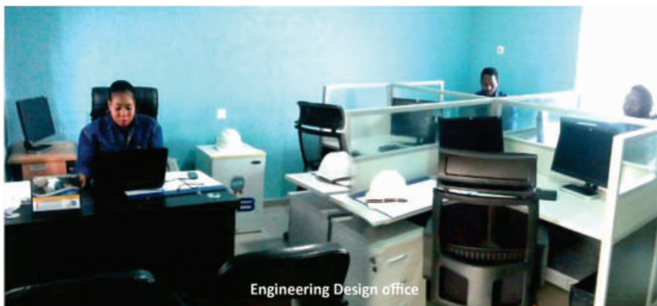
Engineering Design office